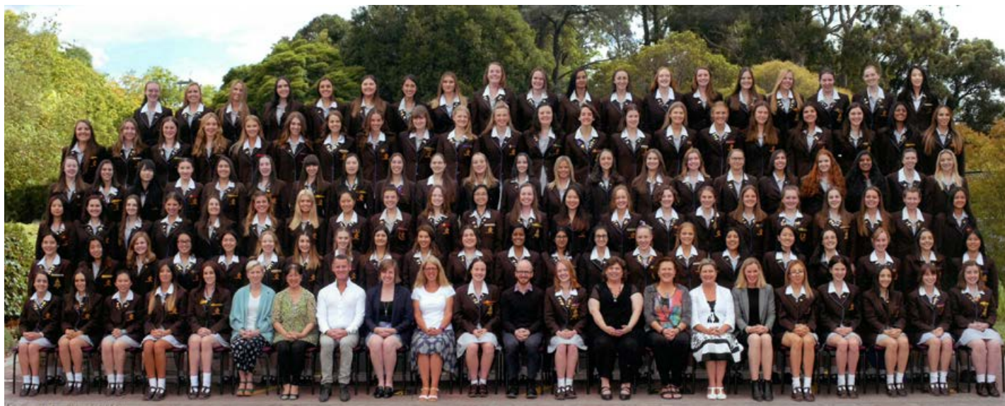
The Class of 2016.